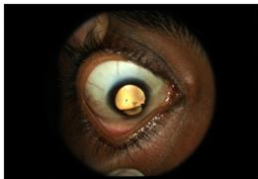
Right eye [pic. No.1]