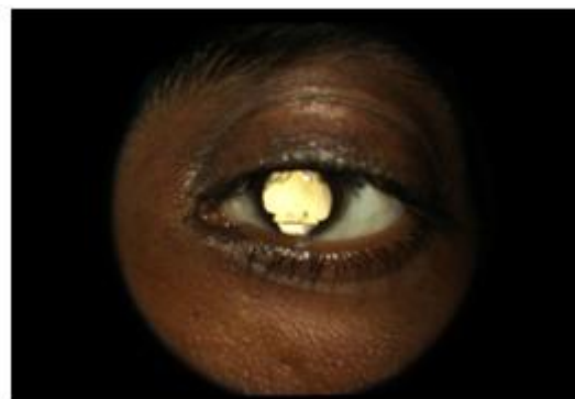
Left eye [pic. No.2]