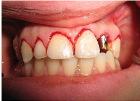
Figs. 4d- Aesthetic surgery for leveling of gingival margins.