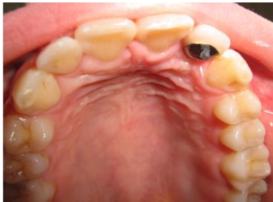
Figs. 5b- Final Restoration.