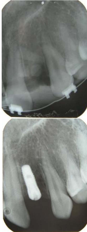
Figs. 4a- PA radiography immediately after graft placement