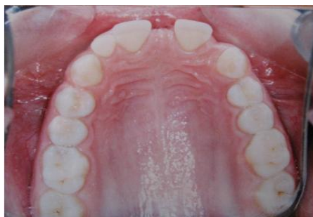
Figs. 1b - Occlusal view of the patient