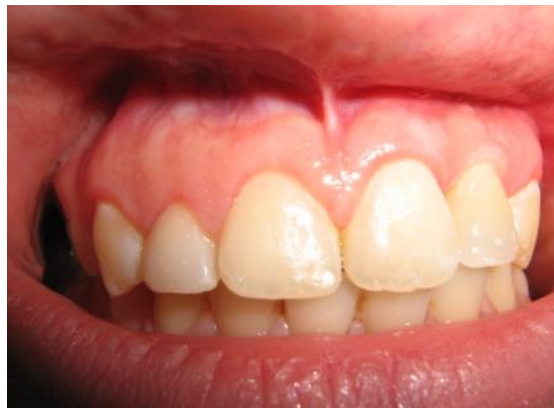
Figs. 5a- Final Restoration