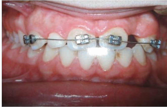
Figs. 2a -Orthodontic treatment for space management