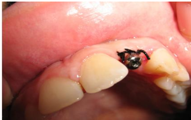
Figs. 4b- Gingival Former placement in second stage surgery