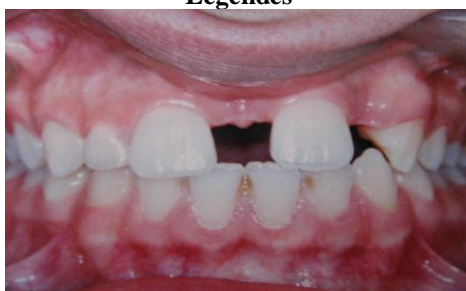
Figs. 1a- Intraoral view of the patient