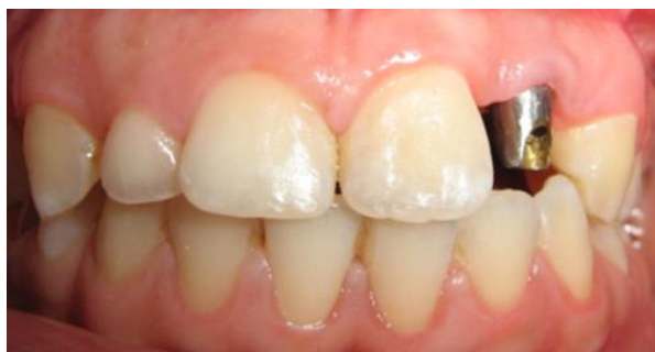
Figs. 4c - Abutment placement