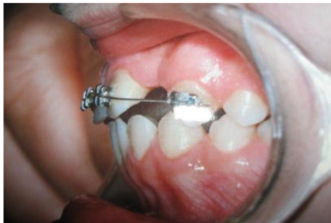
Figs. 2b - Orthodontic treatment