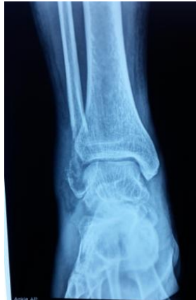
Fig 1 : Ankle AP view

Based on the literature till date, aneurysmal bone cyst occurring at the level of lateral malleolus is rare. Here we report a rare case of ABC at distal end of fibula which was successfully treated with en-bloc excision and ligamentous ankle stabilisation.