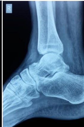
Fig 2 : Ankle Lateral view