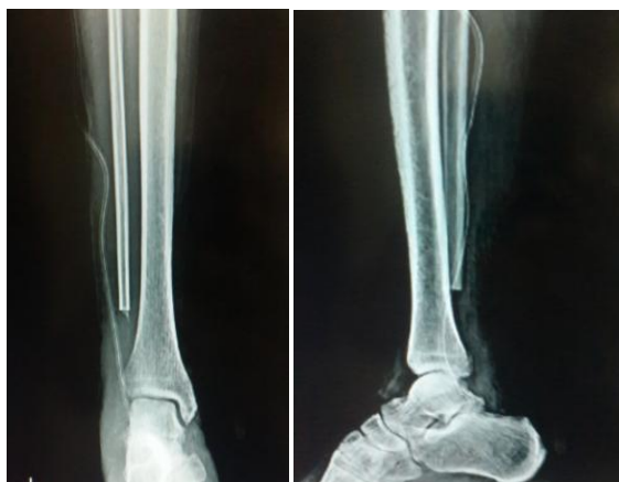
Fig 7 & 8 : Post operative pictures of Ankle joint