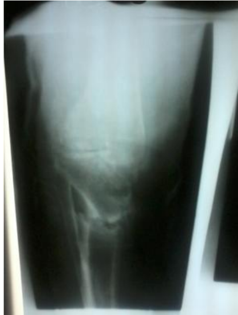
Fig 8: Patient in Fig 2 post-correction