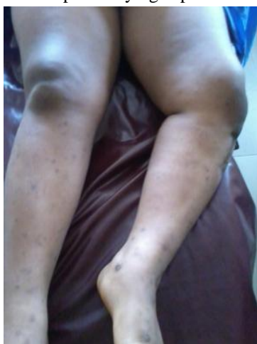
Fig 1: Pre-op picture of patient lying supine