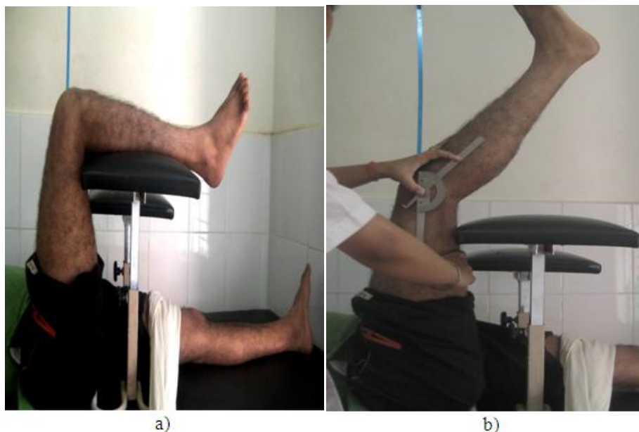
Figure 1. The AKE measurement

Pre-test measurement for AKE angle loss was taken in following manner (figure 1). The patient performed a total of 6 AKEs with a 1-minute rest period in between. The active knee extension (AKE) test was measured with hip flexed to 90^\circ , using half-circle goniometer. The first 5 AKEs were considered as warm-up to decrease any effect that may occur with repeated measures performed from a cold start 7 , 6th AKE was taken as baseline measurement. There was a 60-sec rest period between reps. The stationary arm of the goniometer was placed along the lateral femur, and the moving arm was aligned with the lateral fibula. Subjects extended the knee to the limit of motion. The number of degrees from full extension was recorded. The post-stretch measurement was taken after 4 weeks of treatment. 27