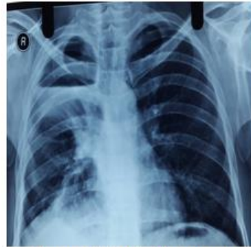
Figure 2. Right side encysted hydropneumothorax (During follow-up)