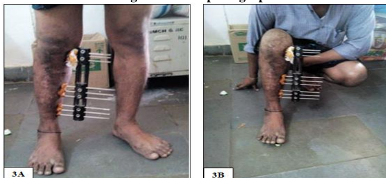
Fig 3: Clinical photographs showing (3A) Tibia postoperative with rail fixator with full weight bearing (3B) range of motion at knee and ankle with rail fixator.