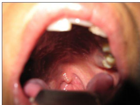
Fig 5. Post operative photographs.