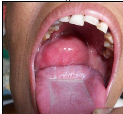
Fig 1. Pre operative photograph showing soft tissue bulge