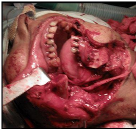
Fig 3. Intra operative photograph .