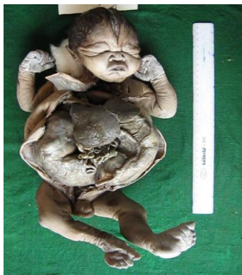
Figure 1: Grossly enlarged kidneys with loss of reniform shape.

Microscopic examination, Kidneys show multiple cysts of various sizes and obscuring renal parenchyma. Cysts are lined by low cuboidal epithelium and surrounded by immature stromal elements(Fig 2). There are also primitive tubules, glomerular structures, islands of dysplastic mesenchyme along with fibrous elements seen. Brain shows oedema and lymphocytic infiltration, Lungs show congestion, oedema and haemorrhage. Other organs were histologically normal.