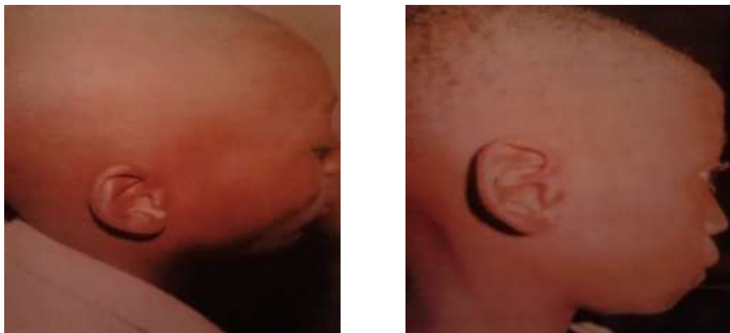
Figure 1: Children with ear discharge