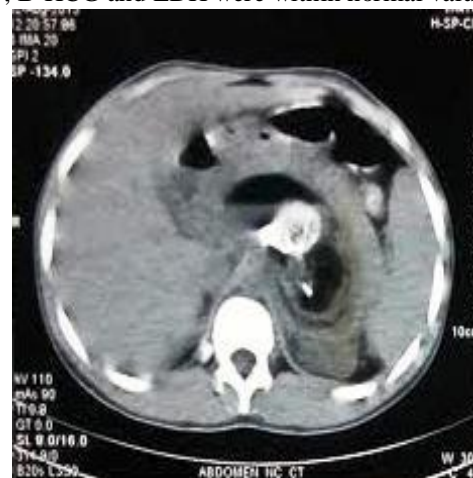
Fig 2.NCCT scan showing mass with