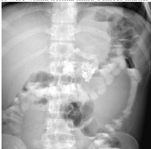
Fig.1 X-ray Abdomen shows calcification with dilated bowel the presence of calcification.

Laboratory blood investigations shows leucocytosis W.B.C 14,500 and Hb-10.5gm%. Others parameters were within normal limit. Tumour marker AFP, B-HCG and LDH were within normal values.