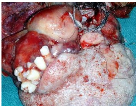
Fig 3. Gross appearance of retroperitoneal mass

In view of above findings he was taken for Emergency exploratory laparotomy. Operative finding revealed large retroperitoneal dermoid tumour (?teratoma mature) with tooth (multiple) with hair and vascular pedicle, tumour and pus like collection of 700 ml. Tumour was anterior to kidney, adherent in retroperitoneal area including mesenteric vessel and adherent to aorta and renal vein and artery in close association with pancreas and portal vein, ureter separate, mesocolon involved but vessels spared. Tumour contains pus and sebum, hair and tooth with capsule. Macroscopically growth measured 8x6x4cm. Microscopically, section show squamous epithelium with intact basement membrane, underneath hair follicle and osteoid material present with areas of haemorrhage and focal chronic inflammatory exudates, few sebaceous glands. Histopathology confirmed the diagnosis of a benign cystic teratoma, benign in nature, with no malignant cells present. Postoperative course was uneventful. After 1 month, in follow up, he is fine with no recurrence or any symptoms.