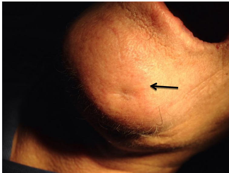
Figure 1: the scar on the left side of chin

The diagnosis was foreign body like inflammatory lesion. The cause of the lesion was a piece of hair comb tooth-like object.