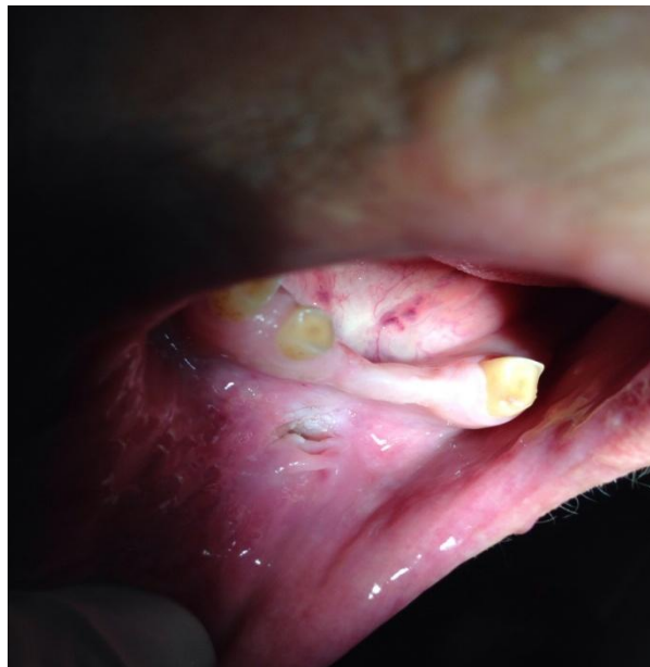
Figure 2: the lesion in the vestibule of the chin