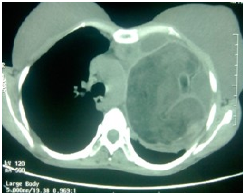
figure 2. Axial cut of CT chest showing the mass of heterogenous consistency and well defined margins , the medial margin blending with the pericardium