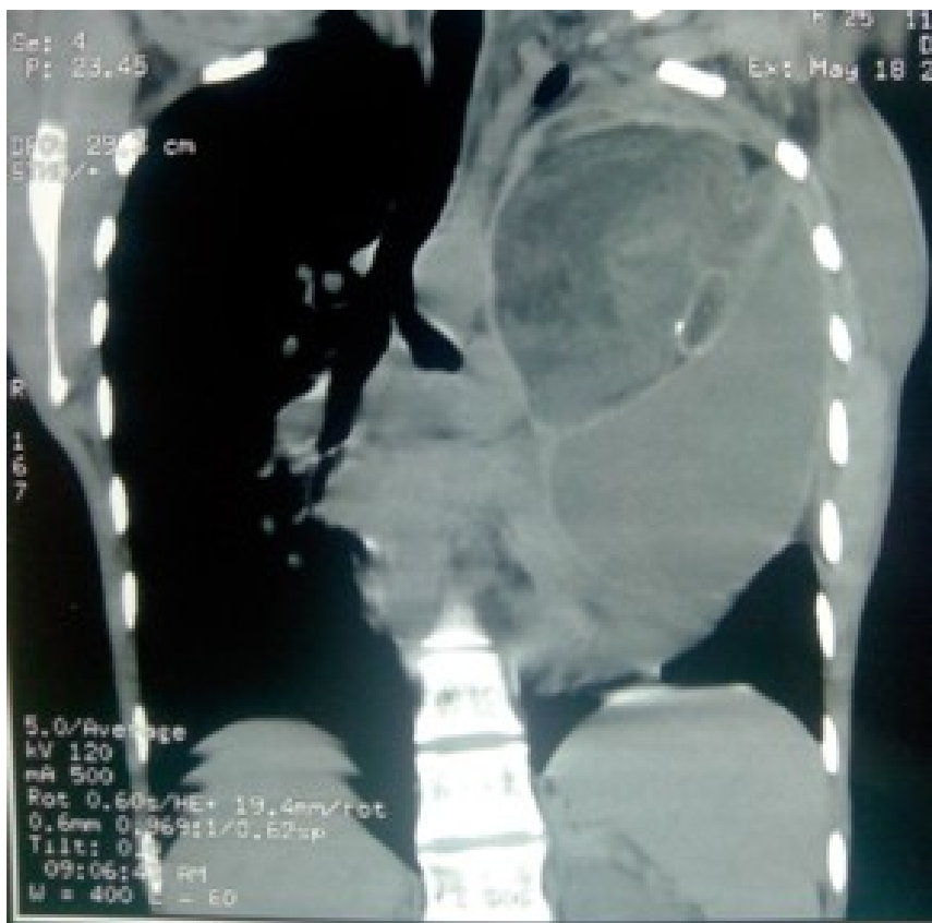
figure 3. CT chest showing the mass causing midline shift to right and compressing the trachea and pericardium