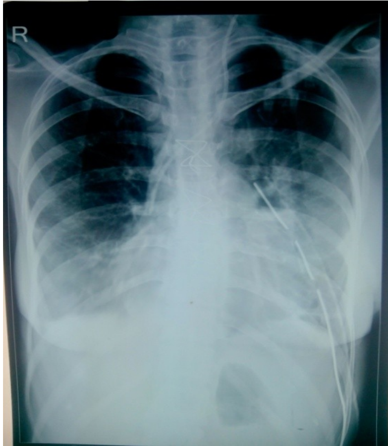
figure 6. Post-operative chest x ray showing the removal of entire mass and chest drain in situ .