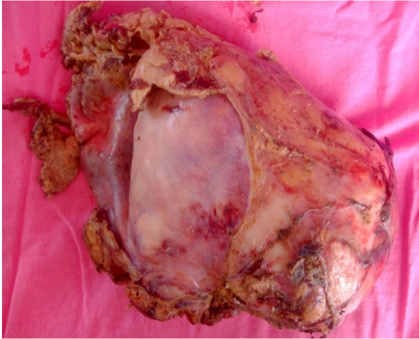
figure 4. Resected specimen cut opened to show the cavity of the mass and heterogenous nature of the mass.