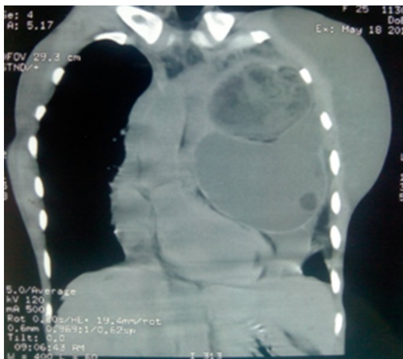
figure 1 . CT chest showing large mediastinal mass with heterogeneous shadows in it, and mass is compressing the middle mediastinal structures including heart