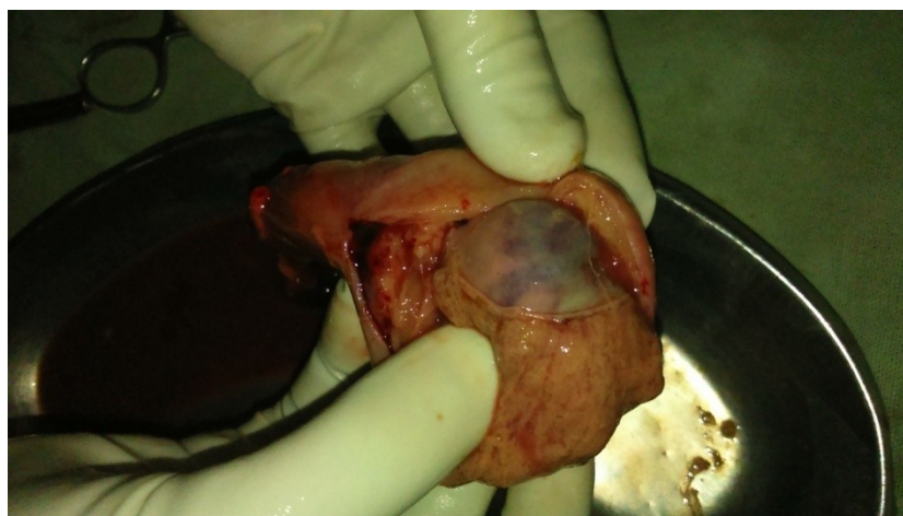
TORTED TESTIS per operative visble ischaemic changes.