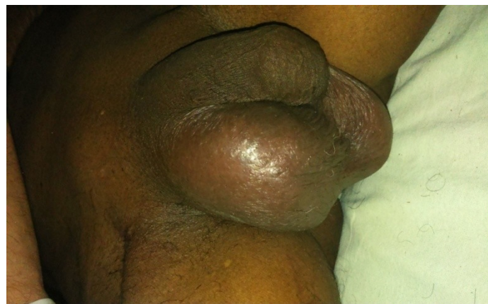
ON table pre-operative appearance of torted testis ; tensed, stretched skin with abnormally placed torted testis .