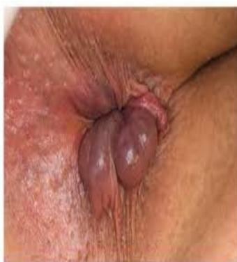
Fig 1: External haemorrhoids,