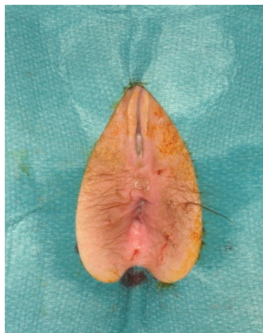
Fig 4: showing closed haemmoroidectomy