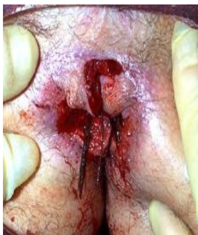
Fig 3: showing open haemmoridectomy