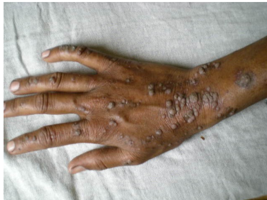
IMAGE 2 - Verruca vulgaris