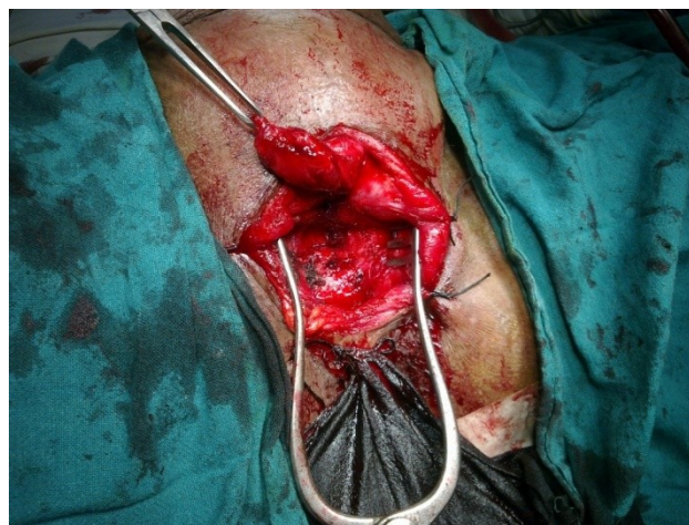
Figure 1:-After crural separation and inferior pubectomy

Figures in parentheses are in percentage