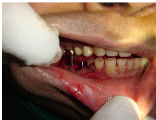
Fig.2: Implant guide pins in place after atraumatic extraction of tooth.