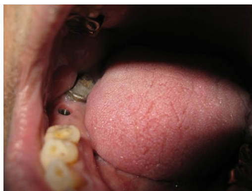
Fig. 6: Gingival collar formed after removal of gingival seal.