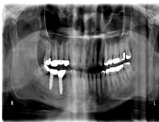
Fig.8: One year Postoperative OPG after placement of P.F.M Crown w.r.t. 46, 47.