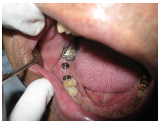
Fig. 5: Gingival former in place w.r.t 46, 47 .