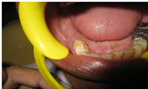
Fig. 4: Postoperative healing after 3 months of Implant placement.