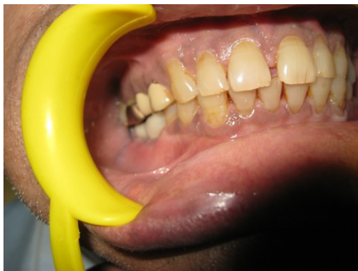
Fig. 7: P.F.M Crown in place w.r.t 46, 47.