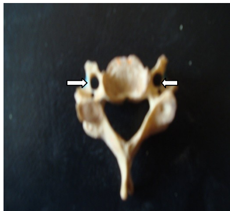
Fig; Cervical vertebra with bilateral accessory foramen transversaria

Also the double foramina were observed in the lower cervical vertebrae i.e. in C4, C5,C6,and C7.Each vertebra showed at least one foramen transversarium on either side.