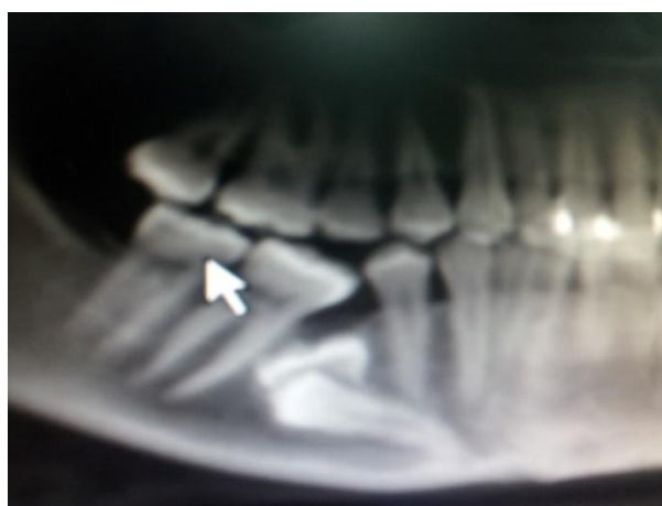
Figure 1: show impacted mand 2nd premolar with impacted E