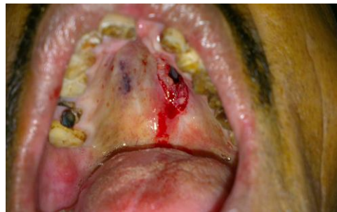
Figure 2: Removal of fistulous tract