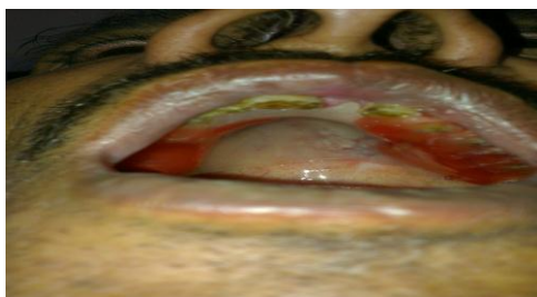
Figure 4: Grafted site covered with prefabricated palatal plate template.