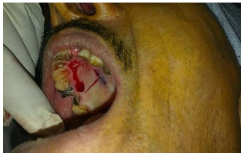
Figure 3:Harvesting of split thickness palatal graft.