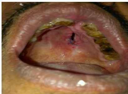
Figure 1:Oronasal fistula defect

We report a 55-years-old male patient who was referred to the department of Oral & Maxillofacial Surgery, for the presence of sporadic intraoral drainage of palate. The discomfort was of a few days duration and had its origin following a road traffic accident, which led to Lefort II #. The radiograph shows no characteristics of OAC/OAF. The patient reported water & food regurgitation through nose after open reduction internal fixation for Le fort II #. The earlier approximation of palatal tissues in the midline was done by freshening of palatal margins & placement of two vertical releasing incisions, but Oro nasal fistula recur within 7 days. The figure 1 shows oronasal fistula defect. The removal of fistulous tract was done as seen in figure 2. The Split thickness palatal graft of 2 x 1.5 cm was harvested from the anterior portion of hard palate (figure 3) & defect was closed with the graft & stabilized with 3-0 vicryl suture. The grafted site after placement of palatal plate as seen in figure 4. Follow up after 1 week was uneventful & healing was satisfactory as seen in figure 5. There was no sign of recurrence on 1 month follow up (Figure 6). The healing on the grafted site was uneventful & the donor site healed by secondary intention.