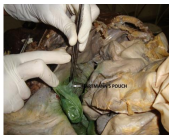
Identification of Hartmann's Pouch