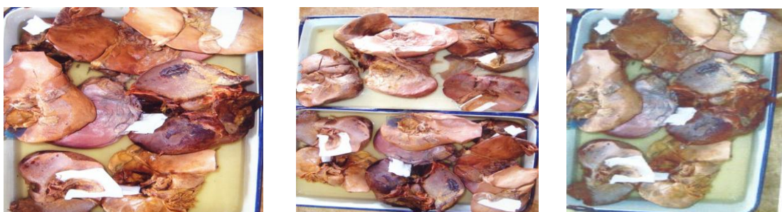
Collection of Specimens

102 bladders of both genders were obtained from the Department of Anatomy , Andhra Medical College, Visakhapatnam, India, over a period of 4 years by routine procedure of standard dissection of cadavers.The cadavers being embalmed and allowed for dissection. The cadavers were embalmed with routine embalming solutions for anatomical dissection.