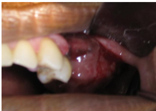
Figure 1: clinical appearance of the growth on maxillary left gingiva