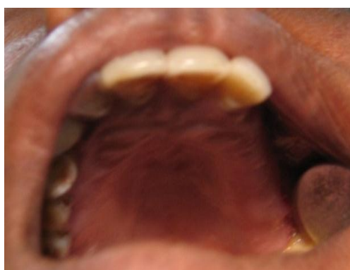
Figure 4: 9month post-op follow-up photograph