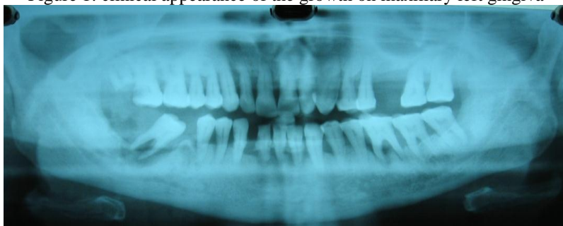
Figure 2: OPG showing generalized interdental bone loss