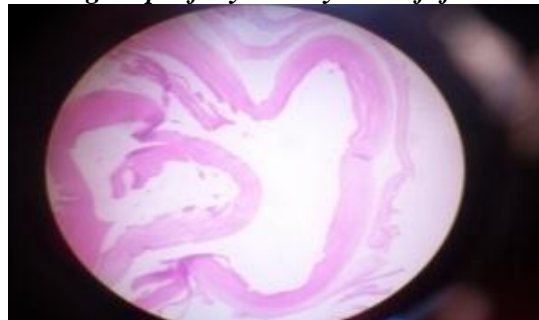
Fig 3.Exocyst (Chitinous wall) of hydatid cyst (H&Ex400)