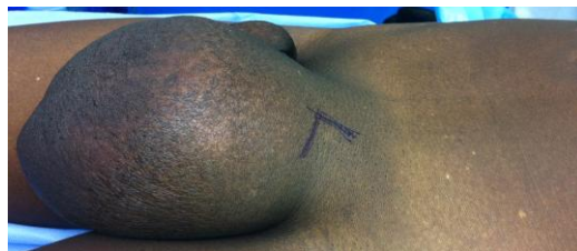
Largeleft scrotal hernia