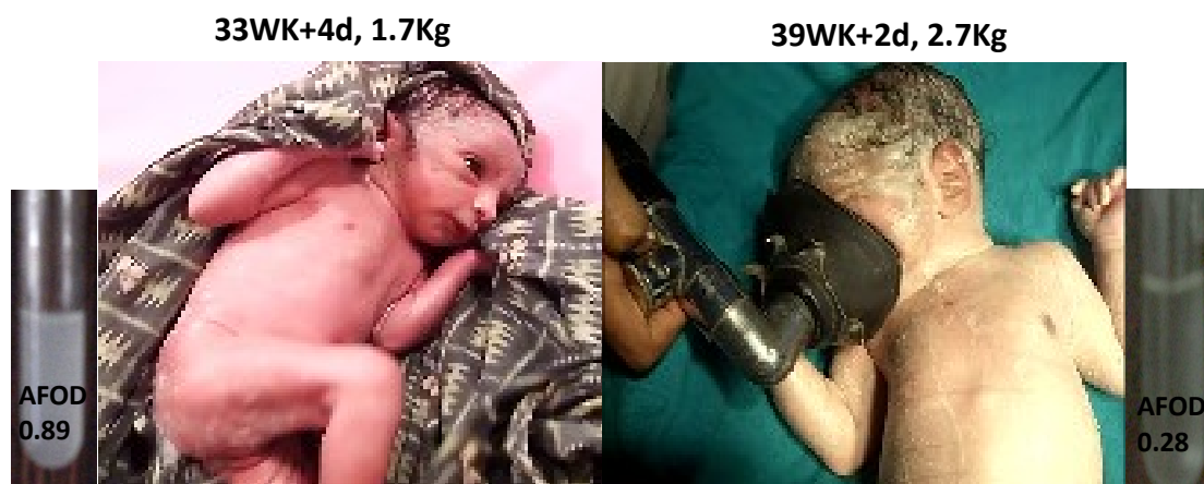
Fig 3: Functionally mature baby with no vernx and RDS at 33wks+4days(left). AFOD was 0.98\pm 0.27 : case No.12 in Table1. Functionally premature baby at 39wks+2days with plenty of vernix and with RDS: AFOD was < 0.40 (right).