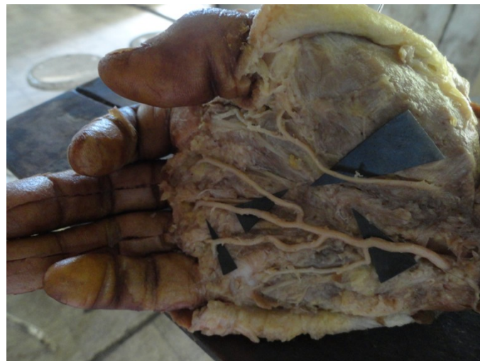
Figure 2: Dissection of Right hand of cadaver showing anomaly of superficial palmar arch