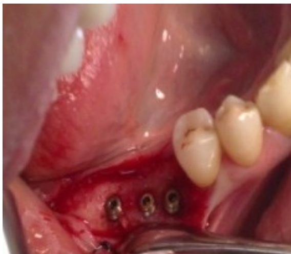
Fig 1: implants inserted in their osteotomies