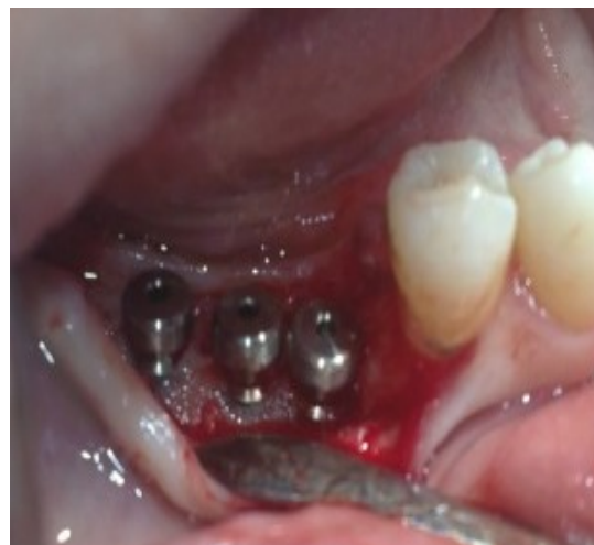
Fig 2: implants exposure and connection of healing abutments