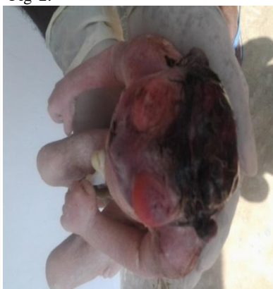
Anencephalic case with angiomatous stroma