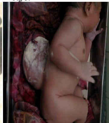
Closed Neural tube defect