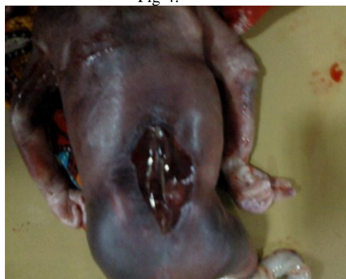
Open Neural tube defect