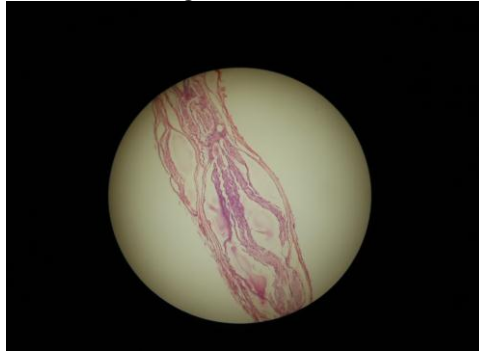
Fig 2: Sural nerve biopsy shows reduction in number of myelinated fibres.