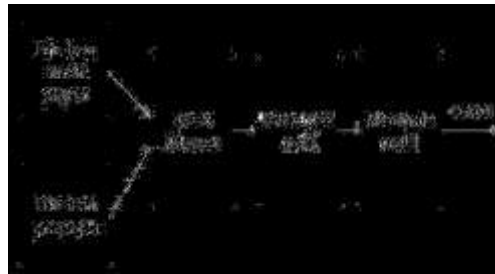
Figure 1: Proposed Neuro-Fuzzy model for cost estimation

Xishi [6] et al. proposed a Neuro-Fuzzy model for cost estimation which is modified in the current paper. It is applied on various estimation problems for accuracy. The Neuro-Fuzzy model contributes