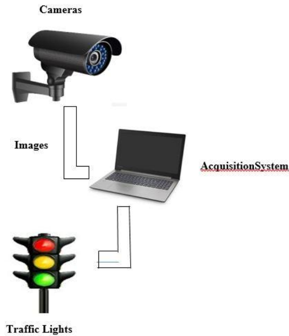
(a) System Architecture