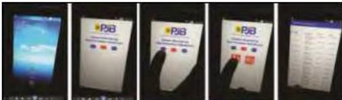
Figure 1. IZAT Application software

Implementation of this software start from May 2016. the K3 officer inspect the fire extinguisher regularly using the IZAT Application data base, as shown in Figure 2. Based on the application, the K3 officer can find out which fire extinguisher will expire and use it for fire fighting training. Therefore, the dry chemical of fire extinguisher can be reuse before it become B3 waste.