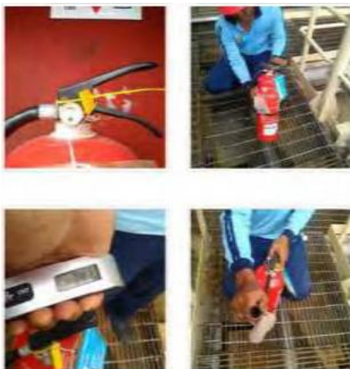
Figure 2. K3 officer inspect the fire extinguisher regularly using the IZAT Application data base

Implementation of this software start from May 2016. the K3 officer inspect the fire extinguisher regularly using the IZAT Application data base, as shown in Figure 2. Based on the application, the K3 officer can find out which fire extinguisher will expire and use it for fire fighting training. Therefore, the dry chemical of fire extinguisher can be reuse before it become B3 waste.