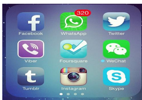
Fig: 2 sharing information by using different social media apps

Keeping in view of existing applications we offer novel features to proposed system that is sharing the information through social media applications. There are many social media applications available to share the information to the users some of them are Facebook, WhatsApp, Instagram, Viber, We Chat etc as shown in fig2. Directly from the m-health application we can share the information to our friend and family members by making use of social media applications.