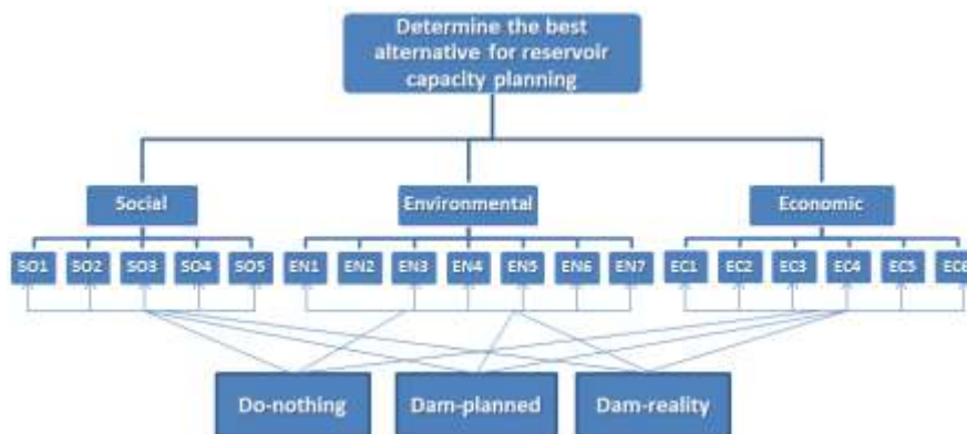
Figure 1 The hierarchical structure for the selection of the reservoir capacity planning

In this study, a hierarchical decision making approach based on multi-criteria decision making approach according to the criteria such as social, environmental, and economic, was presented in order to prioritize the alternatives for reservoir capacity planning for power generation. The hierarchy tree is composed of 3 main criteria, 18 sub-criteria, and 3 alternatives.