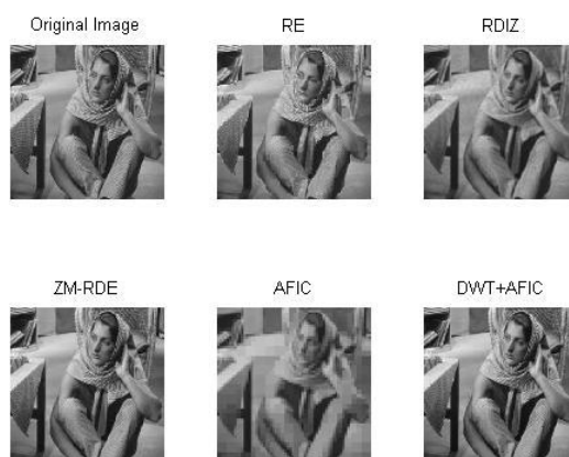
Figure 3.5 barbara image comparison

Figure 3.5 shows about the comparison of reconstructed images of different methods on lena image