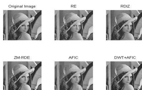
Figure 3.1 lena image comparison

Figure 3.1 shows about the comparison of reconstructed images of different methods on lena image