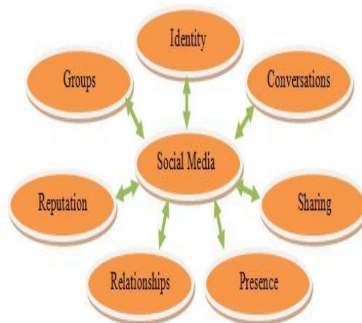
Fig. 2. Social media functionality constructs

Different levels of social media functionalities are mainly constructed from these basic seven blocks: