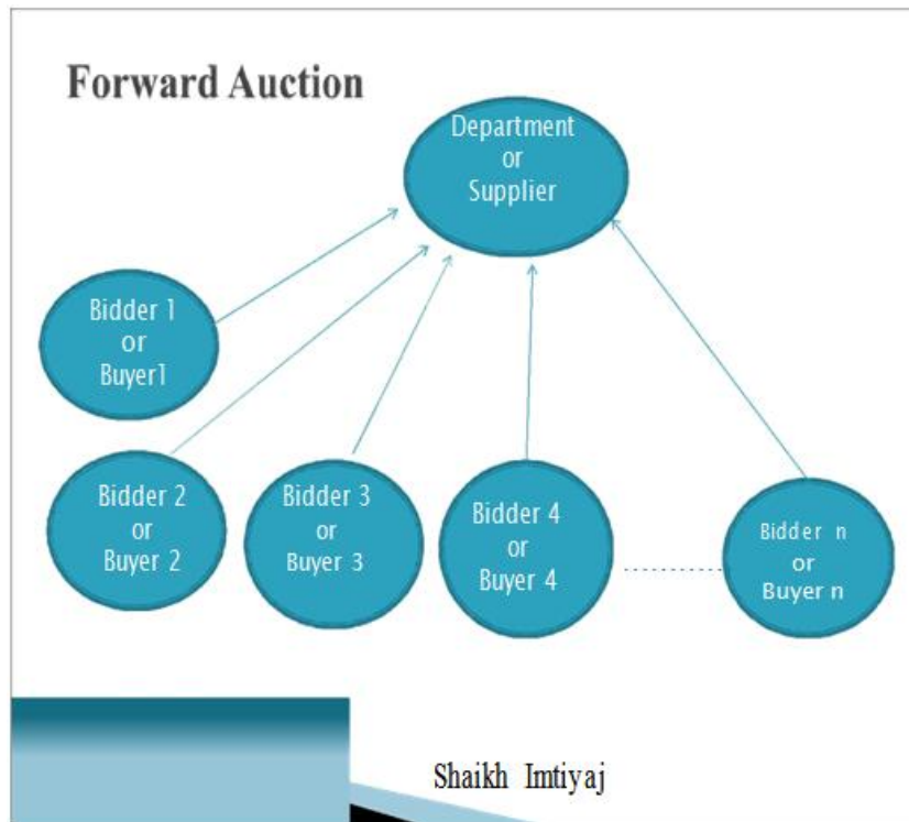
Figure 3: Forward Auction

In the above figure of the Forward Auction, the Buyer1, Buyer2 up to Buyer n are the Bidders who quoted the amount and Supplier means Dept/Auctioneer.