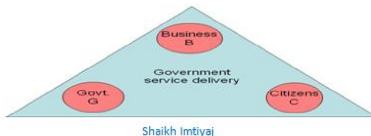
Figure 1: Governance Development Model