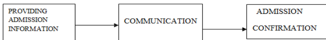
Figure I Broad Phases of Admission System

Corresponding to above mentioned phases Technology use is