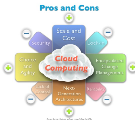
Fig.1 - Pros and cons of Cloud Computing