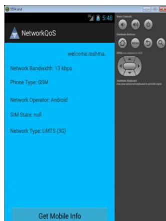
Fig.3: Details of Bandwidth and device parameters