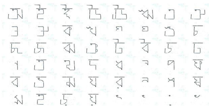
Figure 2: Bangla vowel and consonant by using 32 segment displays

We found 97 compound letters and designed them by 32 segment display. Mainly we collect compound letter list from Bangla Academy Dictionary, there are some compound letters which have no use now a days, that's why by using Bangla font software (Avro, Bijoy) we cannot write them combined but we also design segmented display for them as like ডগ, নচ. The list of all compound letters shown on table 1.