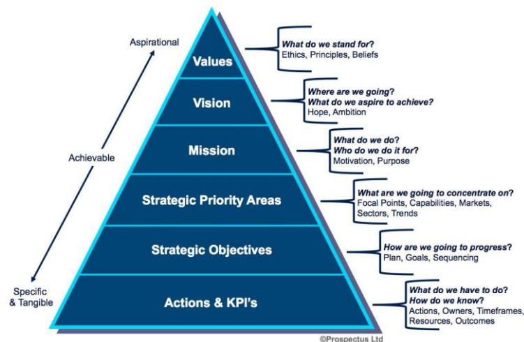
Figure 2- Relationship between ethics, values, vision and mission for organization.

The organizations have mission statement for which it needs a vision and in order to adhere to vision the company formulates values and ethics which are in turn supported by executing and monitoring plans at base level. The Vision and mission statements provide direction, focus, and energy to organization to accomplish the shared goals. The relation between these can be illustrated as in figure 2 (Mc Farlane, 2013)