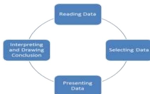
Figure 3: The Constructive Method of Data Analysis

According to Taylor (2002) data analysis starts focusing the collected through questionnaire, interview, observation and notes taken on teaching journal.