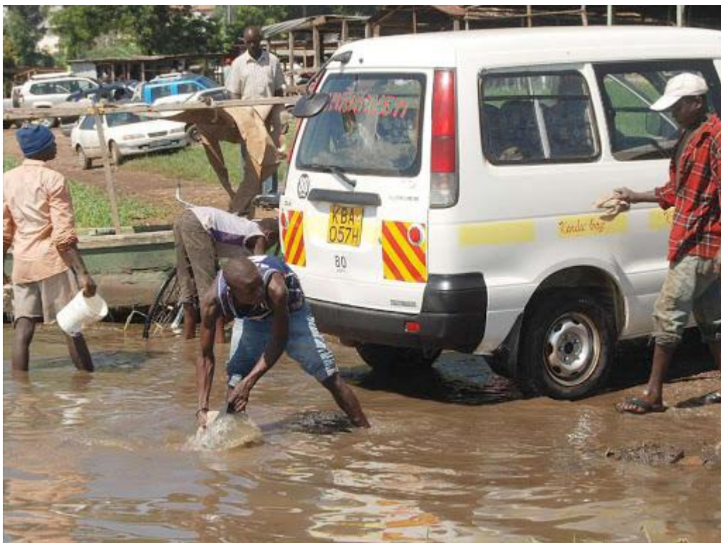
2. Kisumu lakeside car-washers