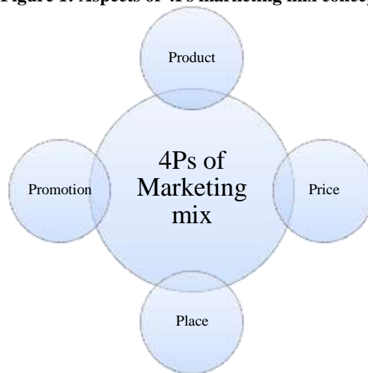
Figure 1: Aspects of 4Ps marketing mix concept

mix concept consists of four aspects including product, price, place, and promotion (Chomraka, Yeamkong, Jindatawin, & Jirawongsatian, 2022; Detthamrong, et al., 2019), as shown in Figure 1.