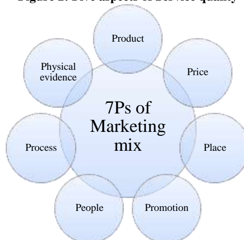
Figure 2: Five aspects of Service quality