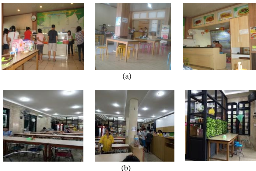
Figure 5 . The arrangement of consumer chairs and tables at Hao Xing Fu Restaurant and Padmamula Restaurant

Restaurants Hao Xing Fu and restaurants Padmamula equally setting up chairs and dining table consumer visitors lined up and is next to the counter and storefront buffet cuisine making it easier for consumers to take food and give the conveniences waitress / waiter in doing good service to consumers, as well as makes it easier for consumers to make transactions at the restaurant's cashier. In addition the waiters and restaurant attendants can see the customers who come up clearly. The interior decoration of Hao Xing Fu Restaurant and Padmam ulla Restaurant can be seen in Figure 5 .