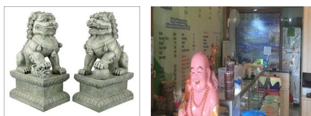
Figure 4. Decorative statues at Padmamula Restaurant (left) and at Hao Xing Fu Restaurant (right) become the choice of the management of each restaurant

Based on field observations of these two vegetarian restaurants, there is no doubt that vegetarianism in Palembang City still highlights the characteristics of worship and the symbols of Buddhist konghucu religion, so as to limit the visit for the general public. Chinese ethnic decorations are also seen on the front yard of Padmamula Restaurant, where there is a Buddhist temple site in the form of a lion statue with an instrument of worship. Picture illustration of the prayer statue displayed in the yard of Padmamula Restaurant and the prayer statue inside the Hao Xing Fu Restaurant can be seen in Figure 4 below.