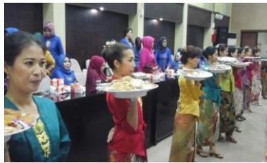
Figure 2. The socialization of vegetarian activities in the provincial government of SumSel organized by IWAPI Palembang