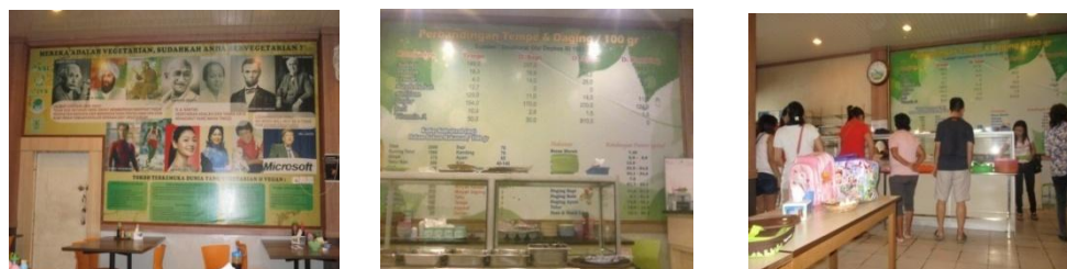
Figure 6 . Restaurant Decoration Hao Xing Fu

diners. This is done by the management of Restaurant Hao Xing Fu and Padmamula, for example by displaying the poster benefits of vegetable and other vegetable products. However, at Padmamula Restaurant, there were no famous vegetarian poster figures, the management of Padmamula Restaurant prioritizes the number of vegetarian dishes on offer rather than decorating the restaurant attractively. But recently Padmamula Restaurant changed the layout of the buffet window and the checkout counter. Where the cashier desk is now on the right of the restaurant entrance and given a table and a waiting chair for consumers who buy food using an online motorcycle taxi service . Can be seen in Figure 6 below.