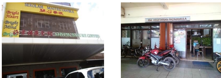
Figure 3 . Front view of Hao Xing Fu Restaurant and Padmamula Restaurant

Based on field observations of these two vegetarian restaurants, there is no doubt that vegetarianism in Palembang City still highlights the characteristics of worship and the symbols of Buddhist konghucu religion, so as to limit the visit for the general public. Chinese ethnic decorations are also seen on the front yard of Padmamula Restaurant, where there is a Buddhist temple site in the form of a lion statue with an instrument of worship. Picture illustration of the prayer statue displayed in the yard of Padmamula Restaurant and the prayer statue inside the Hao Xing Fu Restaurant can be seen in Figure 4 below.