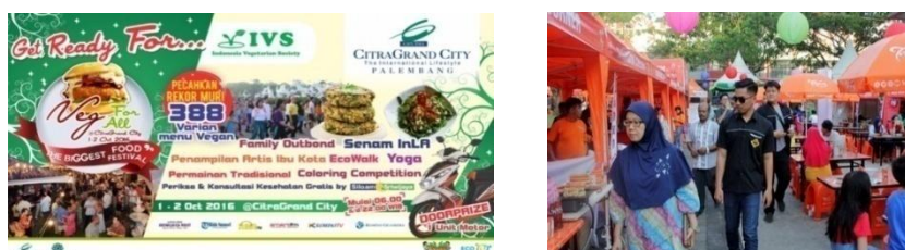
Figure 1. Vegetable based food bazaar titled " Veg For All " organized by Indonesia Vegetarian Society (IVS) Kota Palembang.

The implementation of the vegetarian food bazaar and vegetarian seminar in Palembang City is not often held. Implementation of the latest plant-based bazaar was held on October 1-2, 2016 at Citra Grand City Housing with the theme " Veg For All " many enthusiastic visitors visiting various booths that present 300 variants of plant foods. Show that plant foods can be made into a variety of foods.