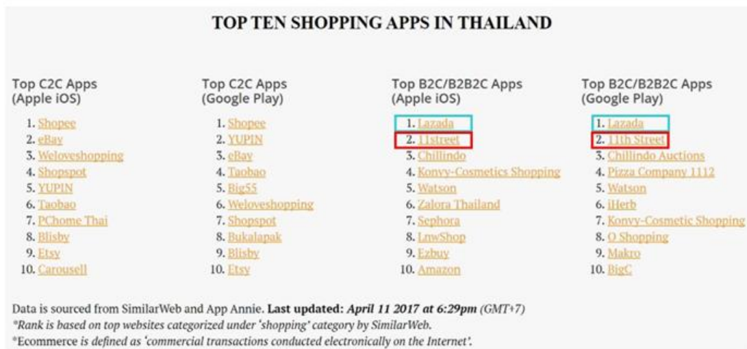
Figures 3. Top C2C and B2C Ecommerce Sites and Apps in Thailand [4]

On the date 11 th April 2017, Similar Web and App Annie issued some reports, saying that the statistical analysis of the mobile APP download quantities from IOS and Android are as follows in Figures 3