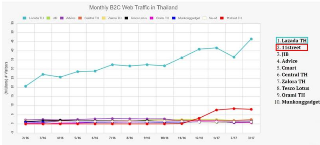
Figures 2. 2016-2017 Monthly B2C Web Traffic in Thailand [4]

According to the data released from the institute of ecommerceiq.asia, the following 10 E-COMMERCE websites are Lazada TH , 11street , JIB , Advice , Cmart , Central TH , Zalora/TH , Tesco Lotus , Orami TH and the Munkonggadget, in them the top 2 websites are Lazada TH and the 11 street.