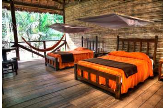
Figure 3 – Posada Amazonas