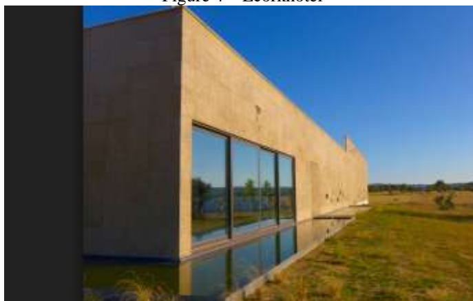
Figure 4 – Ecorkhotel

Similarly, Ecorkhotel, Évora Suites & SPA (figure 4) is a superior four-star hotel born of a 7 million euro investment. Comprising 56 private suites, spa, gym, indoor and outdoor pool, restaurant and meeting rooms, the hotel will be marketed primarily to international clients, as an eco-resort. The hotel's exterior is covered with MD Fachada expanded cork agglomerate supplied by Amorim Isolamentos, over a total area of 1200 m 2 . The choice of expanded cork agglomerate as the central element of the building's look is in complete harmony with the hotel's setting, a magnificent Alentejo landscape surrounded by cork oak forests. The use of the material will result in a number of exceptional benefits in terms of energy savings, a major asset for a hotel designed with eco-efficiency in mind.