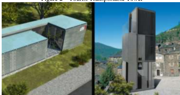
Figure 2 – Tourist Transportable Tower