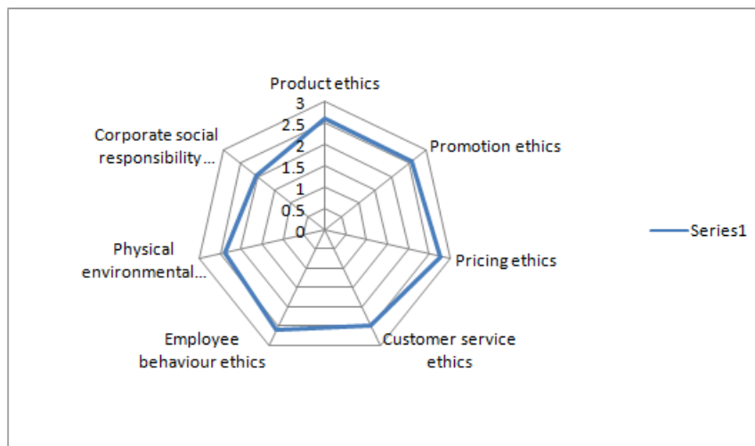
Figure I: Developing The Consumerism Heptagon Model(CHM).

Given that the seven dimensions were statistically weak in terms of consumerism, the researchers propose that various industries and specific firms in both developing and developed world use this model for assessing their ability to meet consumer rights. The model conveniently known as the Consumerism Heptagon Model(CHM) that gives the Marketing Mix, Environmental and Social Responsibility consumerism dimensions was proposed. This model will be used for assessing consumerism performance of service sector firms and industries in both developing and developed countries. Though the model does not explicitly mention the